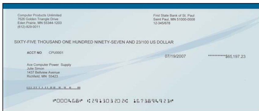
The MICR line on a check allows the check information to be automatically read for quicker processing.

The Reconciliation Import in TRAVERSE Banking enables you to use files downloaded from your bank to automatically clear transactions that have been processed by the bank, a great time-saver.